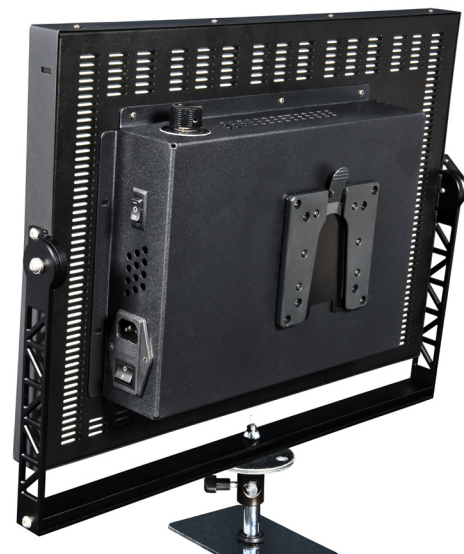
Shown with optional VESA mount hardware (not included).